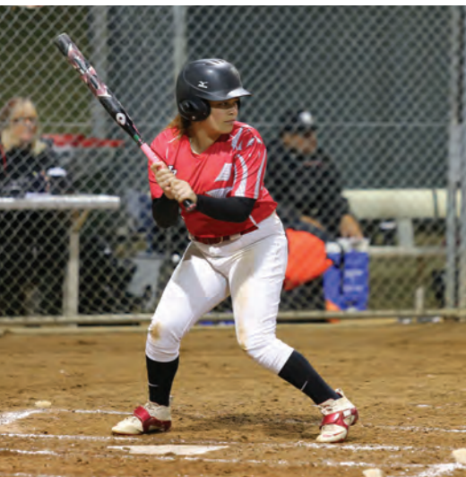
January 2016 Softball Australian Open Women's Gilley's Shield National Championship at Blacktown International Sportspark Sydney