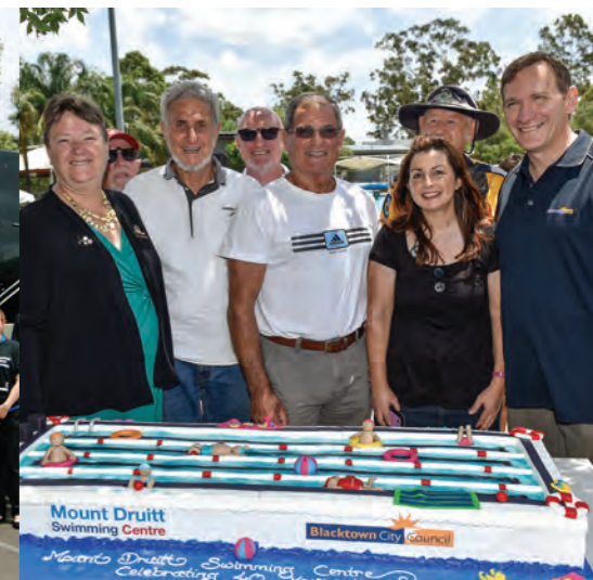
December 2015 Mount Druitt Swimming Centre's 40th Birthday