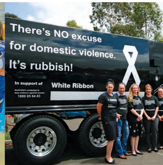
November 2015 Key Venues supports White Ribbon Day