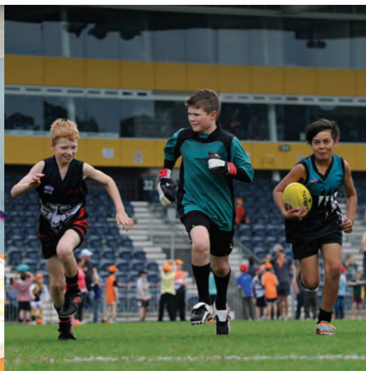
August 2015 Blacktown City Family SportsFest at Blacktown International Sportspark Sydney