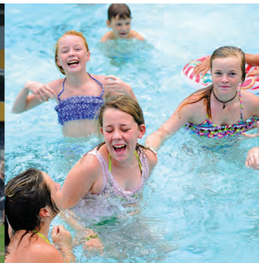
September 2015 Season Opening at Mount Druitt & Riverstone Swimming Centre