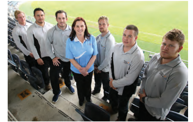
Blacktown International Sportspark Sydney Staff