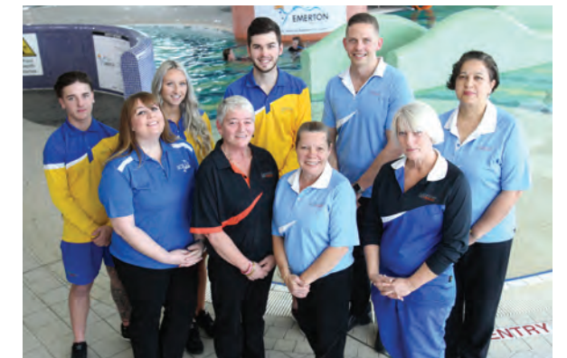
Emerton Leisure Centre Staff