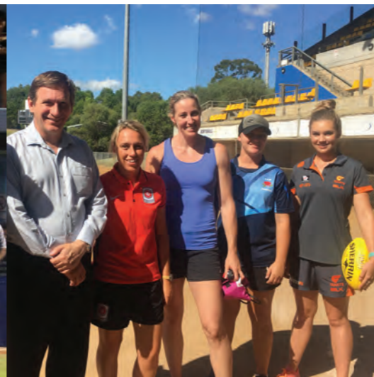
March 2016 International Women's Day at Blacktown International Sportspark Sydney