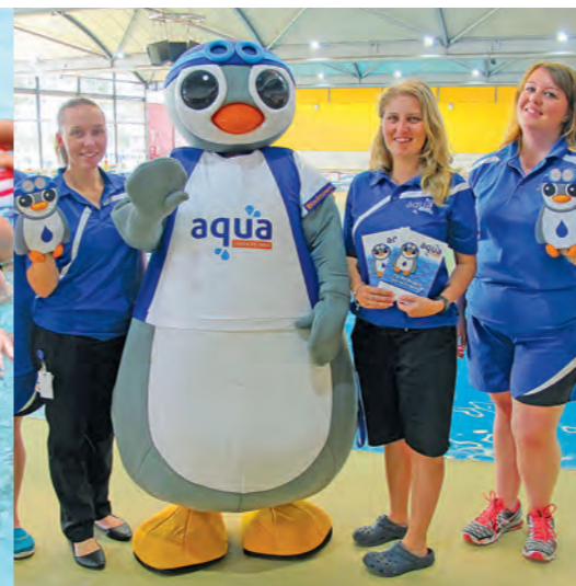
October 2015 Aqua Learn to Swim Launch