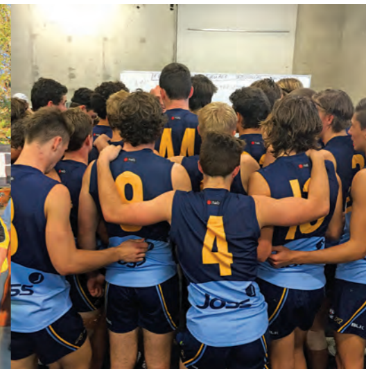
May 2016 Under 18 National AFL Championship at Blacktown International Sportspark Sydney