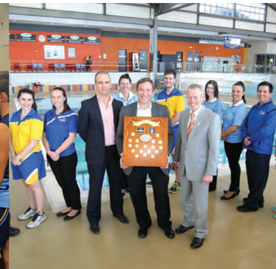
June 2016 Blacktown Leisure Centre Stanhope named AH Pierce Memorial Facility of the Year.