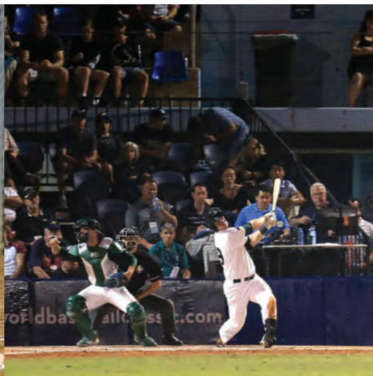
February 2016 World Baseball Classic Qualifiers at Blacktown International Sportspark Sydney