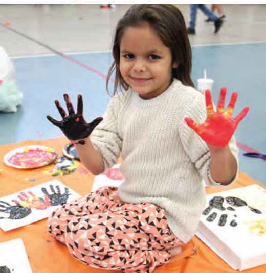
July 2015 NAIDOC Week at Emerton Leisure Centre