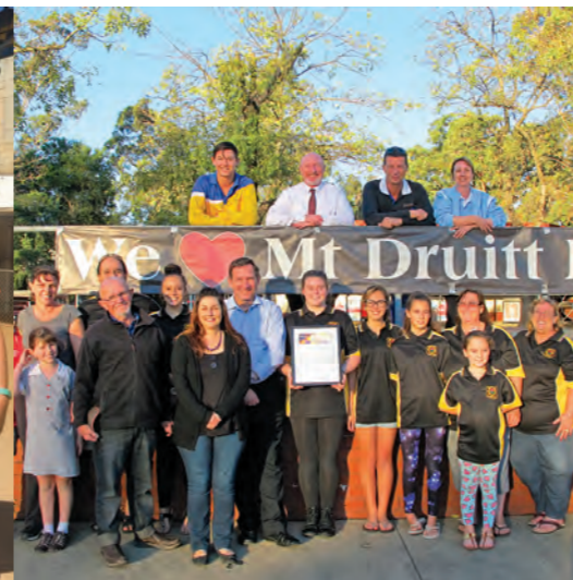
April 2016 Mount Druitt Swimming Centre wins NSW/ACT Parks & Leisure Australia award for Inclusive and Connected Communities