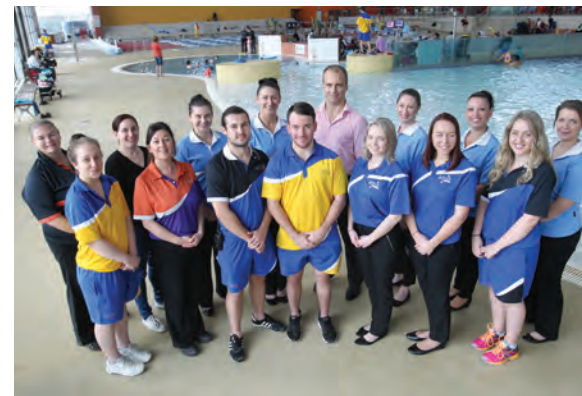
Blacktown Leisure Centre Stanhope Staff