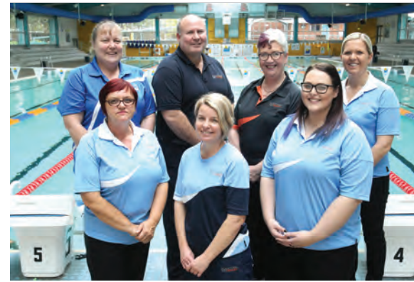
Blacktown Aquatic Centre Staff